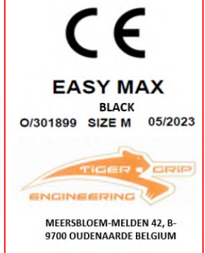
Made in China Hecho en China Fabriqué en Chine